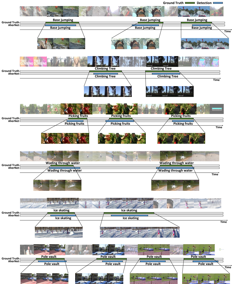
Fig.2: Examples of six temporal action localization results on the setting of ANet→K600. In each example, a video is shown as a sequence of frames at the top. The green boxes in the upper bar denote the ground truth proposals, whose sampled frames are illustrated at the bottom. The localization results are shown in the lower bar, where a blue box denotes a predicted proposal from AherNet on the condition of \text{IoU} \geq 0.7 .